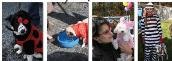
A small sampling of participants at Dogtoberfest 2008