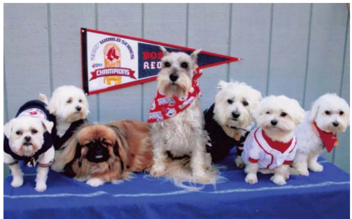
From Left to Right: Dazy Lamport, Blakely Ferguson, Bella Ward, Zoe Swopa-Hill, Happy Khalife, Dooney Townsend and Molly Callahan.

We love our sports teams in Boston, no question there! In honor of all the successes our awesome teams have had, we asked owners of some of our regular small dog day care boarders (under 35 lbs.), in Little Paws Loft, to help us celebrate by having their pictures taken in their favorite team, colors, t-shirts, jerseys and bandannas. There was so much interest that we ended up doing another photo shoot in December. This time the theme was snowflakes.