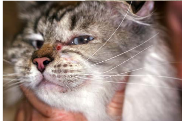
"Kitten" before and after surgery.

Advancing the Standards of Veterinary Care